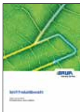
BAUR product overview