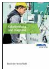
Cable testing and diagnostics