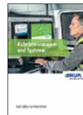
Cable test vans and systems