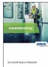
Cable fault location