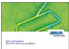
BAUR company brochure